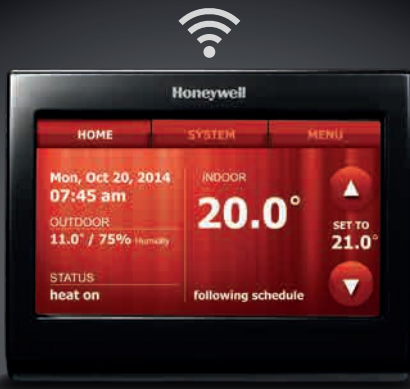
Voice Controlled Thermostat Listens. Learns. Saves.