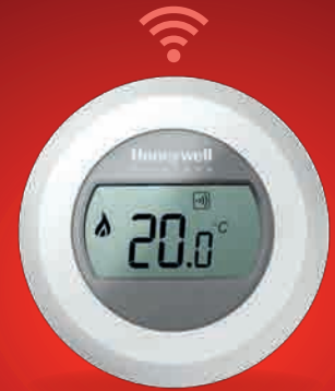
Single Zone Thermostat A true source of comfort.