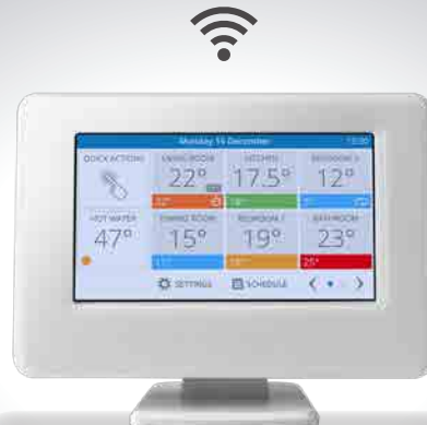
evohome – now with built-in WiFi Create the perfect comfort zone.